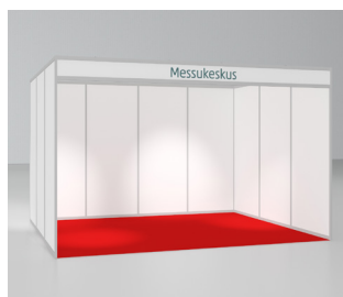
Profile structure (row stand)